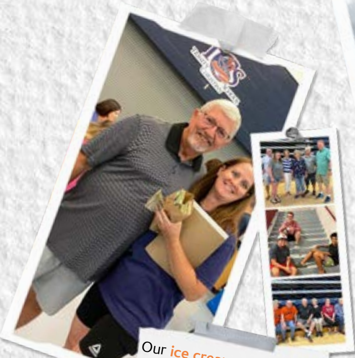
Our ice cream social raised over $1,000 for the Angel Quilt Ministry .