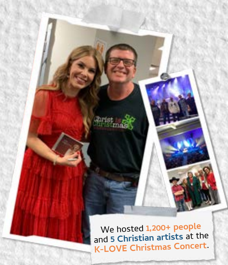
We hosted 1,200+ people and 5 Christian artists at the K-LOVE Christmas Concert .