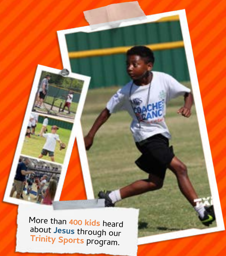
More than 400 kids heard about Jesus through our Trinity Sports program.