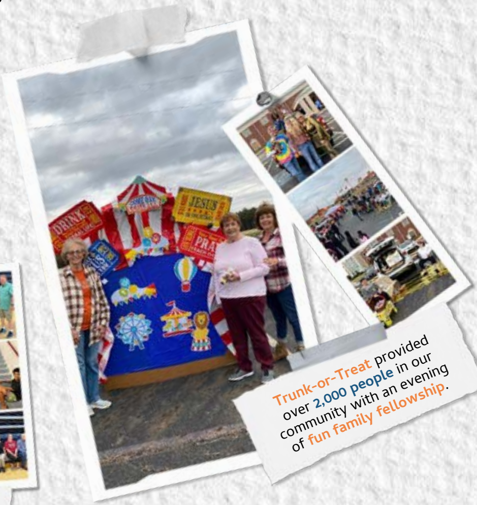
Trunk-or-Treat provided over 2,000 people in our community with an evening of fun family fellowship .