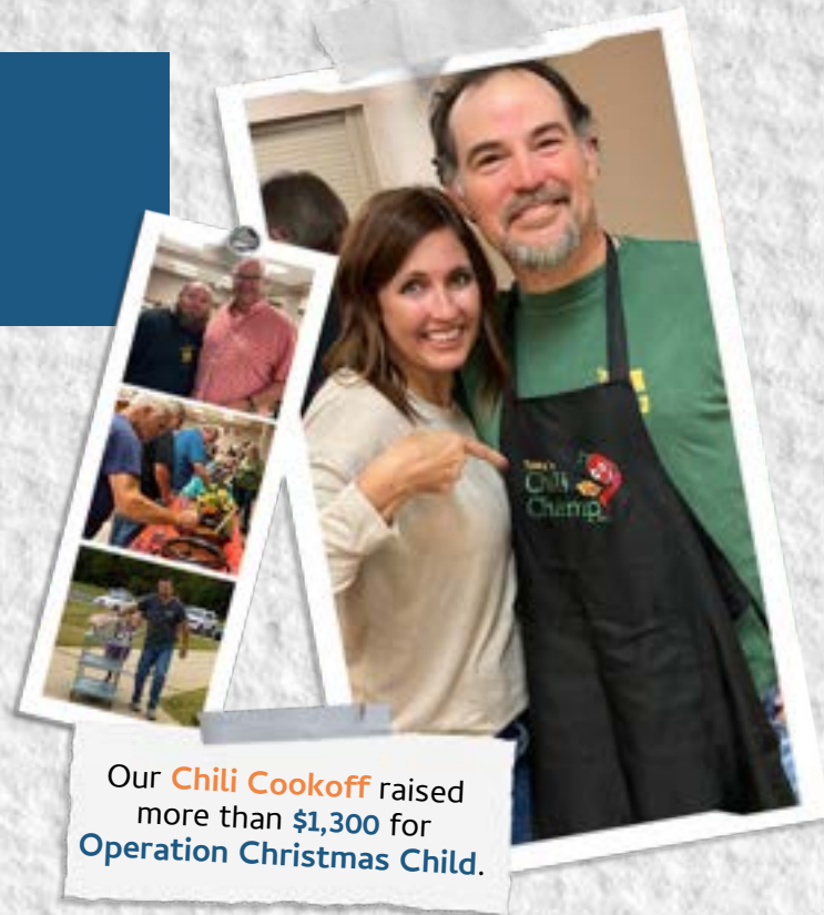
Our Chili Cookoff raised more than $1,300 for Operation Christmas Child .