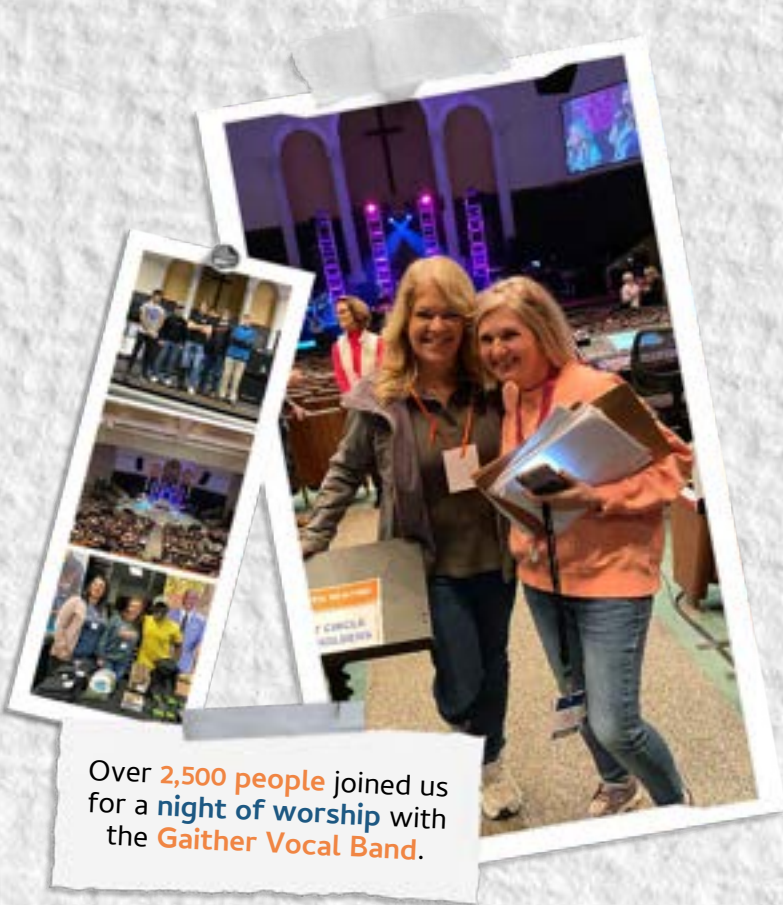
Over 2,500 people joined us for a night of worship with the Gaither Vocal Band .

So whether you eat or drink or whatever you do, do it all for the glory of God.