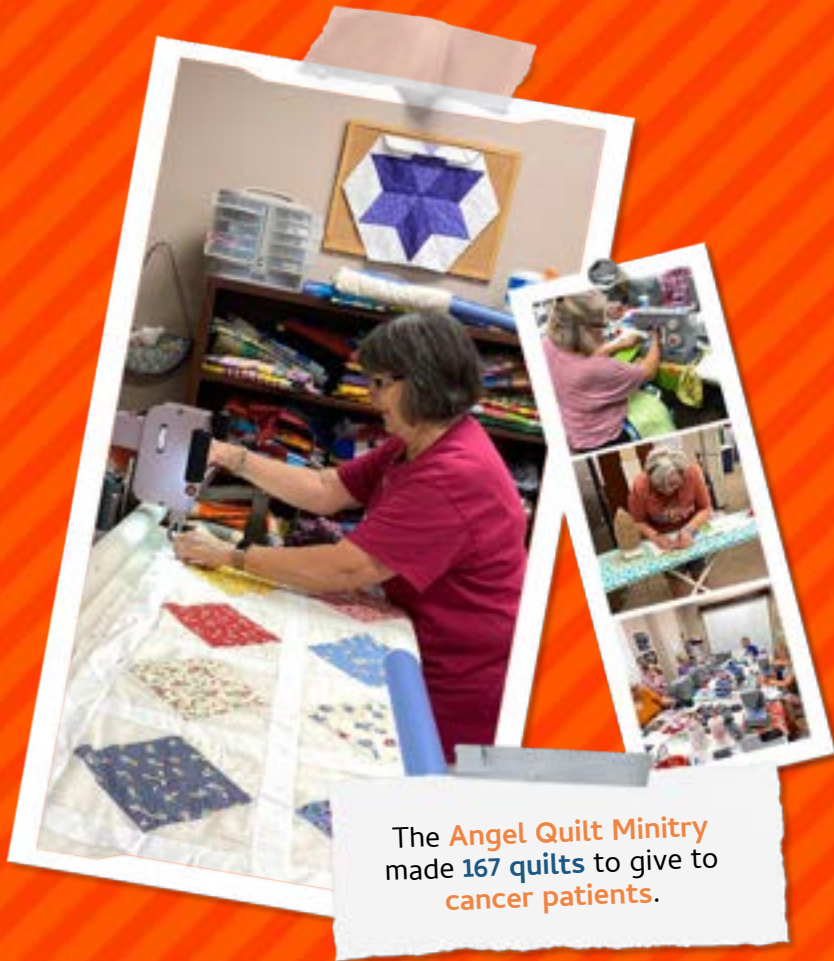
The Angel Quilt Ministry made 167 quilts to give to cancer patients.

For he will command his angels concerning you to guard you in all your ways.