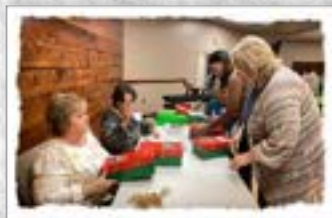
600+ shoe boxes commissioned for Operation Christmas Child .